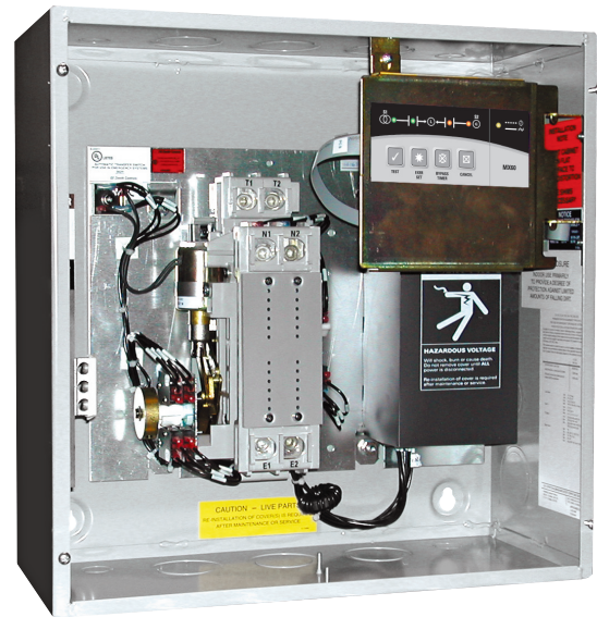
Zenith ZTX Series Small Frame Residential, Commercial & Light Industrial Switch with LED Control Panel (cover removed)

All time delays are fixed (non-adjustable).