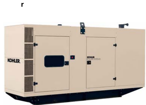
With Available Enclosure Accessory

RATINGS: All three-phase units are rated at 0.8 power factor. See TIB-109 for generator set derate tables. Obtain the technical information bulletin (TIB-101) on ratings guidelines for the complete ratings definitions. PRP: Prime power is available for an unlimited number of annual operating hours in variable load applications in accordance with ISO-8528/1. A 10% overload capability is available for a period of 1 hour within a 12-hour period of operating in accordance with ISO-3046/1. ESP: The emergency standby power rating is applicable for supplying emergency power in variable load applications in accordance with ISO-8528/1. Overload is not allowed. The generator set manufacturer reserves the right to change the design or specifications without notice and without any obligation or liability whatsoever.