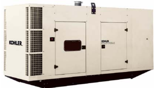
With Available Enclosure Accessory